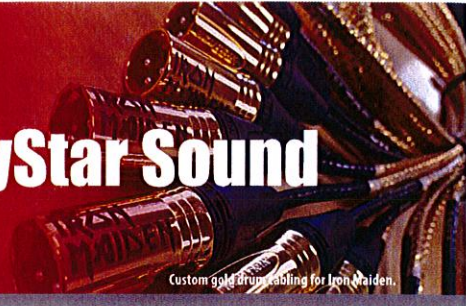
Custom gold drum cabling for Iron Maiden.